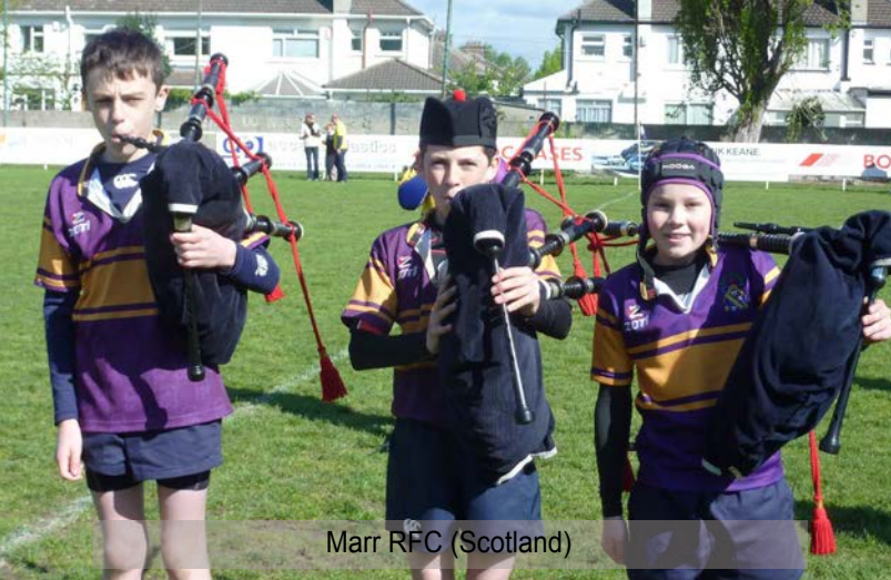
Marr RFC (Scotland)