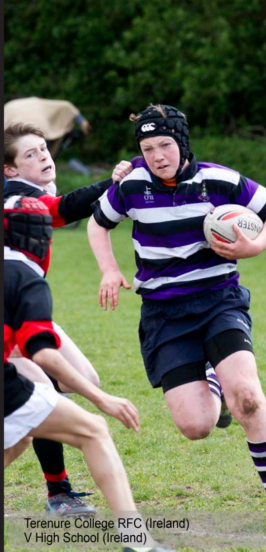
Terenure College RFC (Ireland) V High School (Ireland)