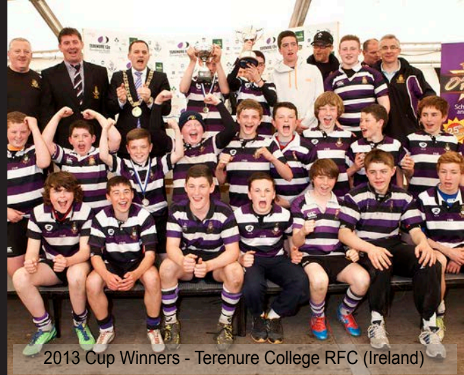
2013 Cup Winners - Terenure College RFC (Ireland)

All teams will be given the maximum amount of game time with the minimum amount of down time. This is our guarantee to all competing teams!