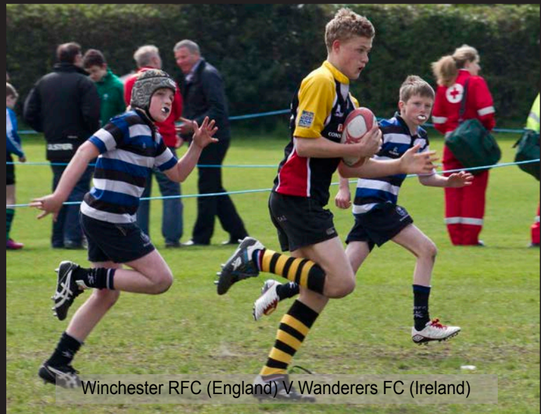
Winchester RFC (England) v Wanderers FC (Ireland)