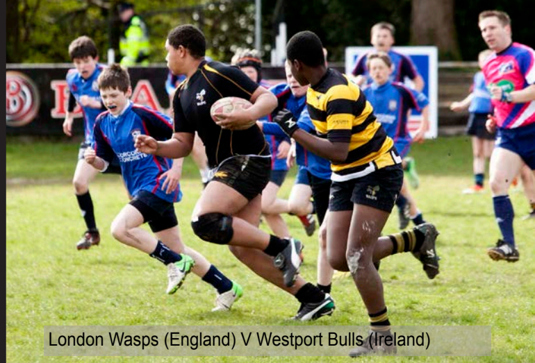
London Wasps (England) V Westport Bulls (Ireland)