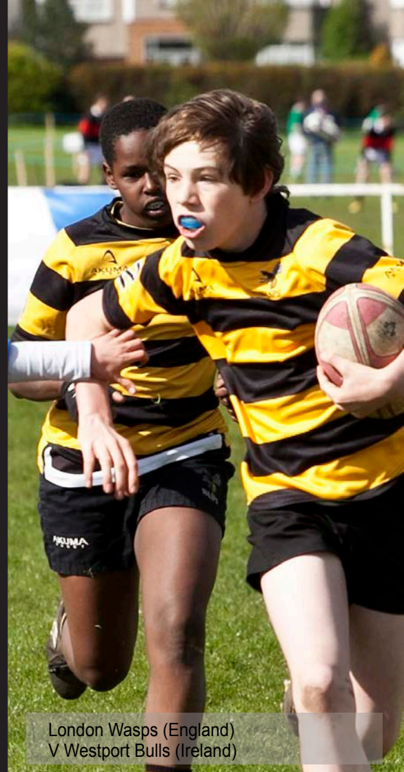
London Wasps (England) V Westport Bulls (Ireland)