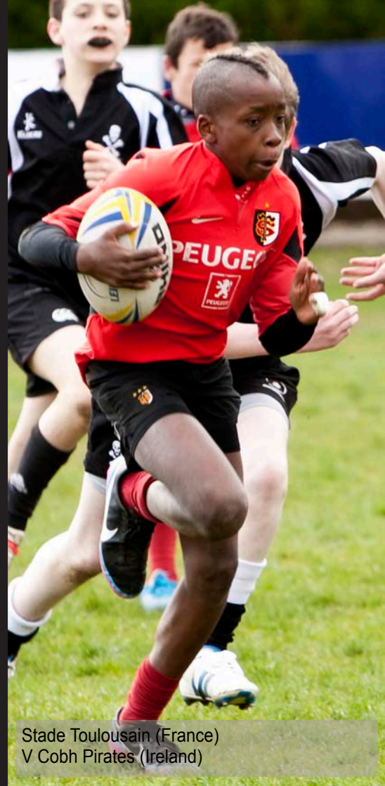
Stade Toulousain (France) V Cobh Pirates (Ireland)