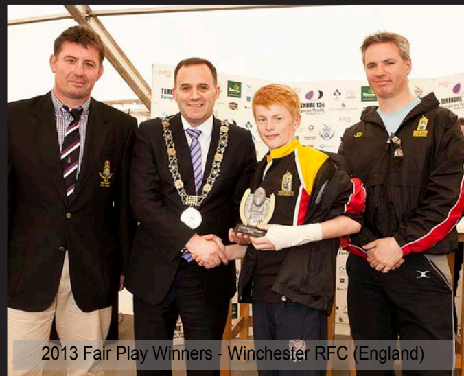
2013 Fair Play Winners - Winchester RFC (England)