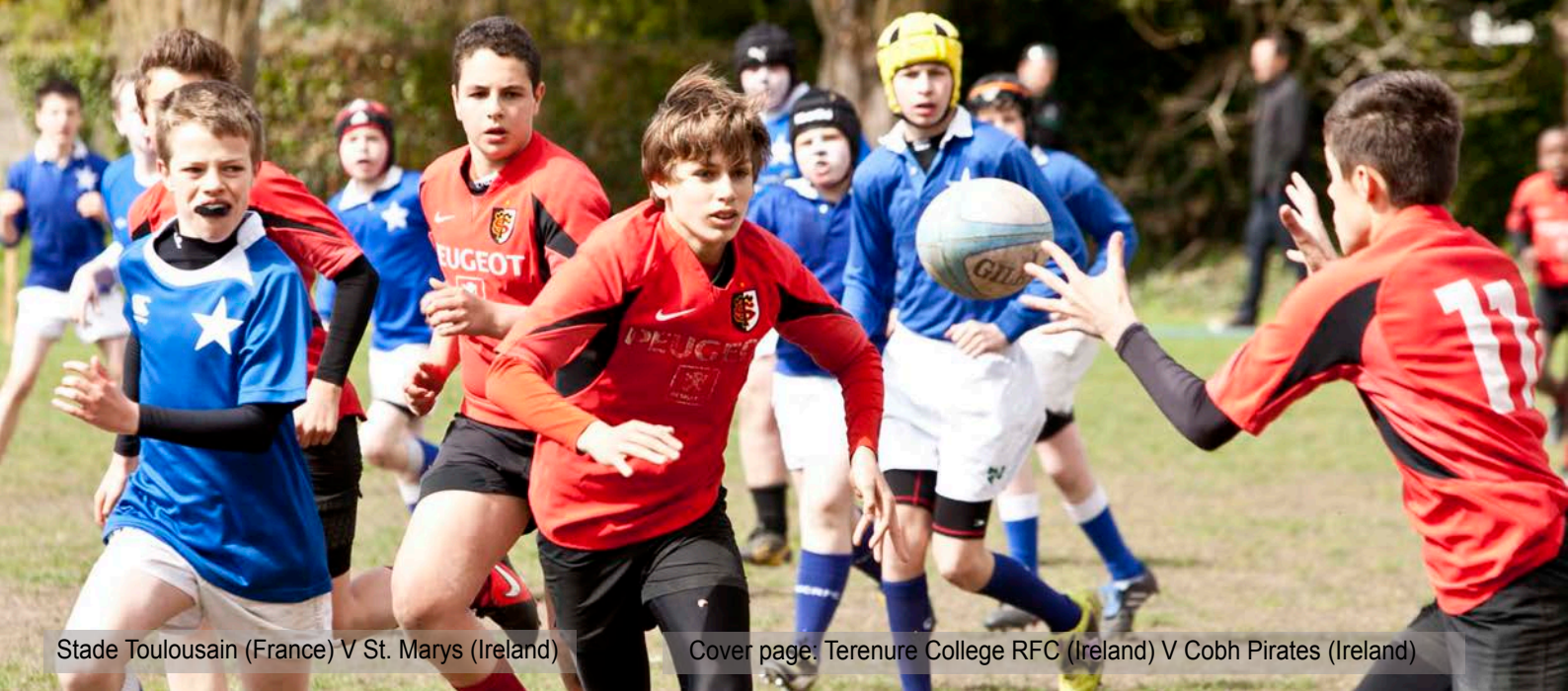
Stade Toulousain (France) V St. Marys (Ireland)